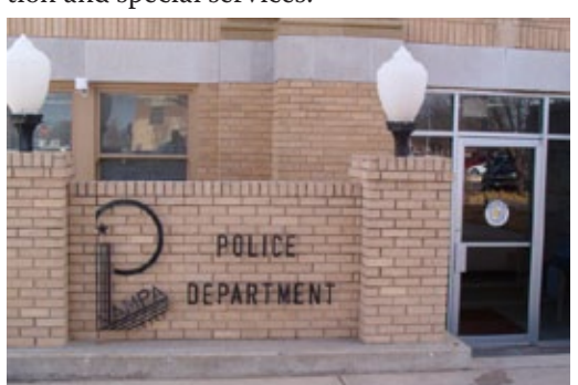
see RECOG Page 3

The city charter established the Pampa Police Department on November 8, 1927. The police department has an authorized staff of 26 sworn officers and 10 non-sworn employees (with eight personnel in communications and two non-sworn clerks). The Pampa Police Department is a full service police department with four major divisions of patrol, criminal investigation, administration and special services.